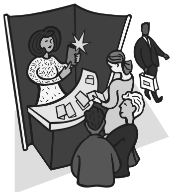
Table Fee: $20 - includes lunch

Contact the Wayne Chamber of Commerce office to sign up and for more information about sponsorship opportunities. Look for sponsorship information coming in an e-blast soon.